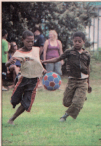
Two boys with one thought - how do I keep this ball.