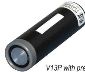
V13P with pressure sensor

For research requiring temperature and depth information, V13 tags can be equipped with temperature, V13T, or depth, V13P, or both temperature and depth sensors, V13TP. V13P pressure transmitters are available in the following full scale pressure options: 17, 34, 68, 136, 204, 340, and 680 meters. V13T temperature transmitters are available in four temperature ranges: -5 to 35°C, -4 to 20°C, 0 to 40°C and 10 to 40°C. (See sensor tables for accuracy and resolution details.)