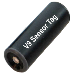
Available with both depth and/or temperature sensor options